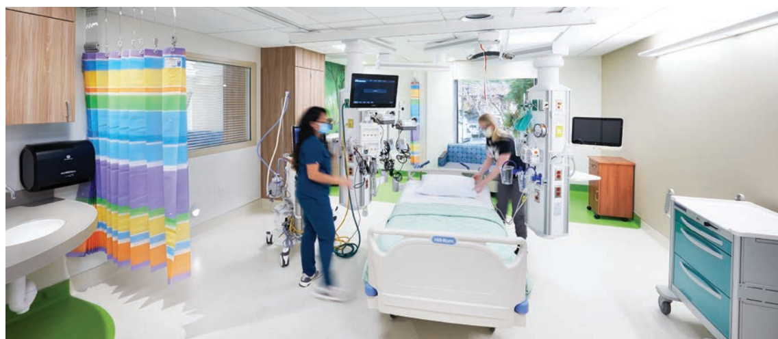
Nurses at work in UCSF Benioff Oakland's newly renovated Pediatric Intensive Care Unit

How one family is investing in others who are digging deep to stay strong